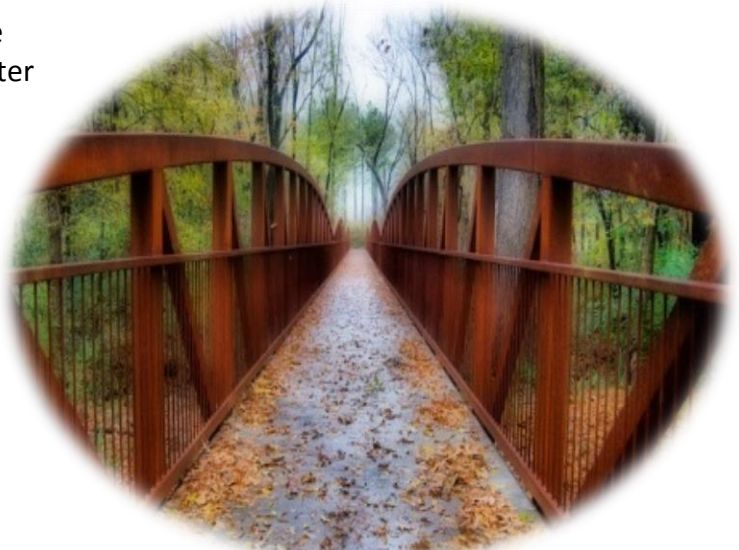
Skin Willits Fine Art Photography

For both females and males in the 14 & under, 15-19, 20-24, 25-29, 30-34, 35-39, 40-44, 45-49, 50-54, 55-59, 60-64, 65-69, 70 and up. Participants age 10 and younger must be accompanied by an adult registered in the race. Participants under the age of 18 must have parent's signature.