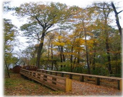
Skin Willits Fine Art Photograph