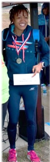
Skip Willits Fine Art Photography