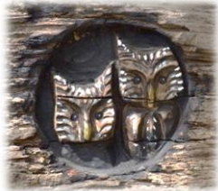
Skip Willits Fine Art Photography