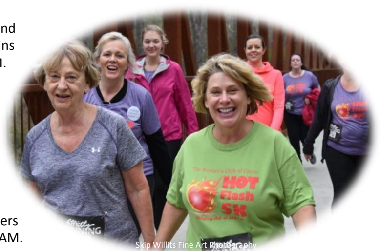
Skip Willits Fine Art Photography

$250 1 st place, $150 2 nd place and $100 3 rd place to top overall male and female finishers. $50 to the first male and female master (40+). Medals to the top three male and female finishers in all age groups. Award ceremony starts at 11 AM.