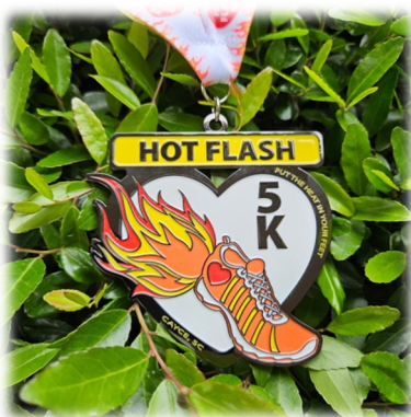
2025 HOT FLASH FINISHER MEDAL!