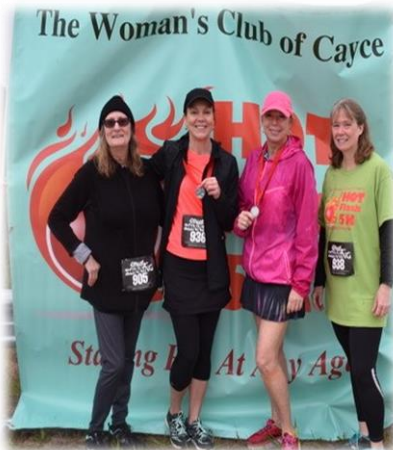
Skip Willits Fine Art Photography