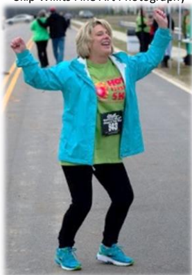
I DID IT!

The proceeds of this event support the community programs of the Woman's Club of Cayce . Organized in 1937, the mission of the Woman's Club is to promote the community of Cayce and the health and well-being of its citizens. For 80 years, the Woman's Club of Cayce has supported the Cayce and Lexington County community by providing a yearly scholarship for a qualified High School Senior, hosting the yearly Christmas Tree Lighting for the City of Cayce, volunteering and funding God's Helping Hands (a Cayce emergency ministry organization), volunteering at Nancy K. Perry Children Shelter, holding an Easter Party for Lexington County Foster Children, Cancer Care Caps for local cancer patients and sponsoring a special City-Wide Random Acts of Kindness project. Your support of the HotFlash 5K helps us reach our service goals.